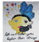
A matter of life or meth... A selection of P awareness slogans created by young Clutha residents.

driven by the people who needed it." An awareness campaign and fundraiser followed, assisted by group founders and Clutha Youth Council, and Brave Hearts was up and running in Balclutha in November 2019.